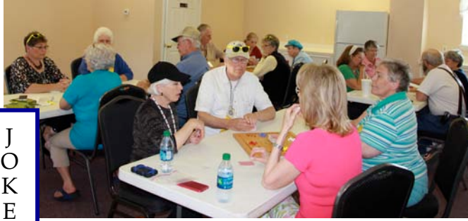
J O K E R