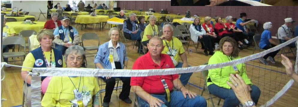
Bean Bag Baseball!