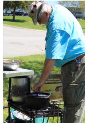
Dutch Oven Cooking!